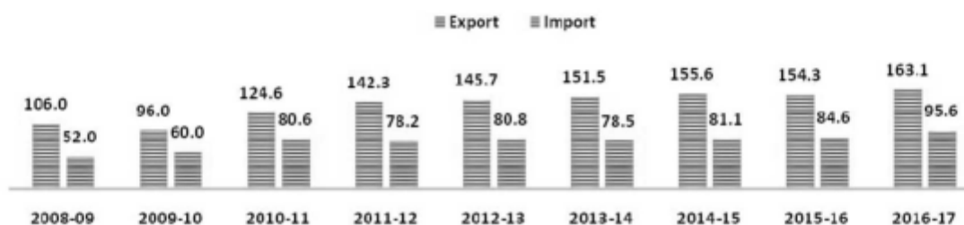
Chart 3: India's Services Trade